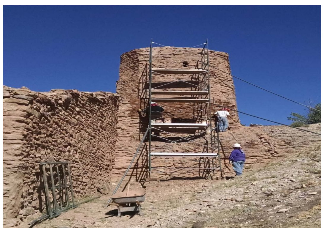
Jemez Pueblo Preservation Specialist working on the San Jose Mission at Jemez Historic Site.

leadership when decisions or actions have potential impacts on Native American human remains, cultural objects, cultural properties or sensitive knowledge.