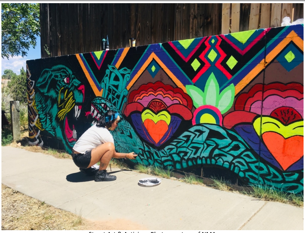
Street Art & Activism.