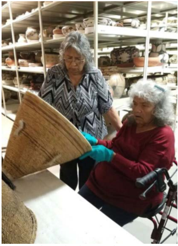
Hualapai Cultural Center Delegates viewing materials collected from their community in the 1930s.