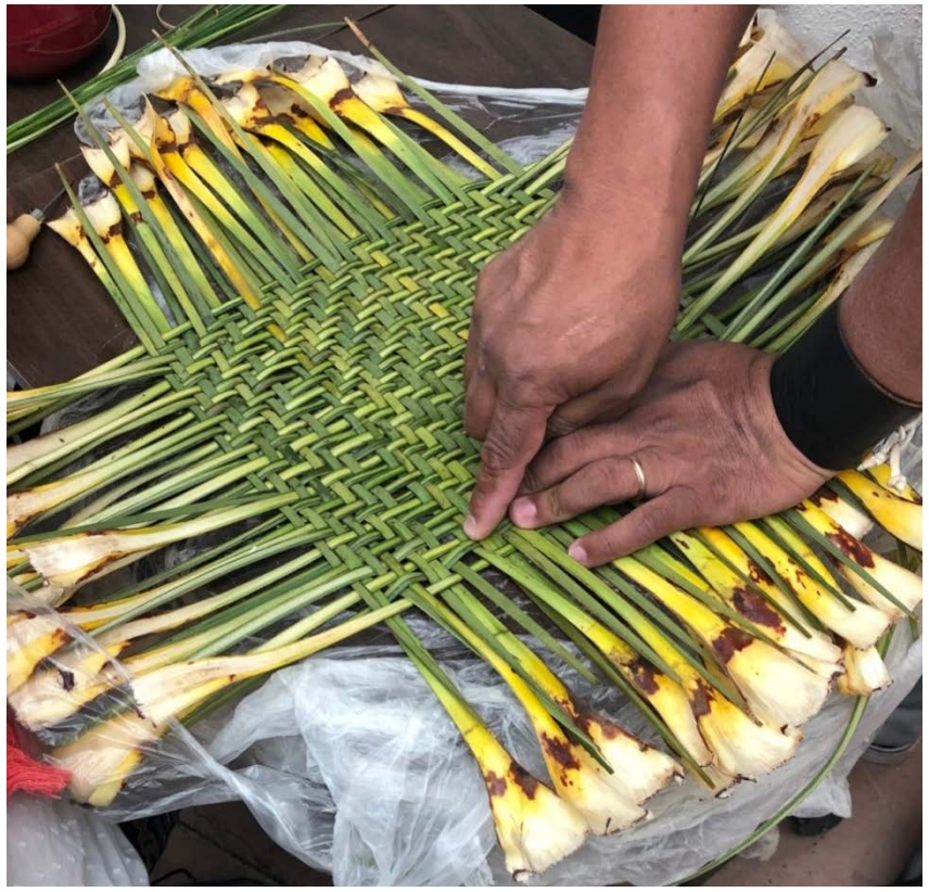
Sumac basket weaving.