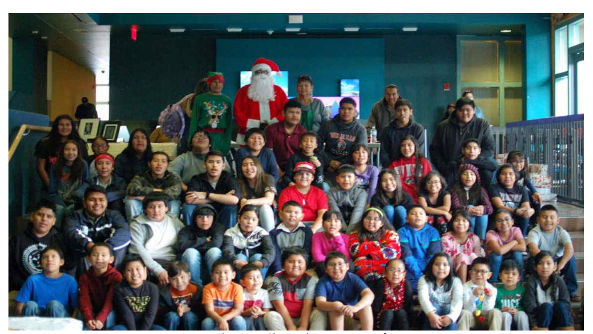
Native Youth Winter Show.

In addition to being part of the team involved with the innovative Indigenous Digital Archive Project, the New Mexico History Museum (NMHM) supports economic self-reliance with its Portal Native American Artisans Program, commonly known as the Portal Program. More than 600 Native American artisans, from over 20 tribes, are involved with the Portal Program, located at the NMHM's Palace of the Governors. The artisans help develop and guide the policies of the program. NMHM provides support by sponsoring a Native Youth Artist show highlighting the artistic skills of Portal Program artists' children and grandchildren as well as helping the artists sell their works.