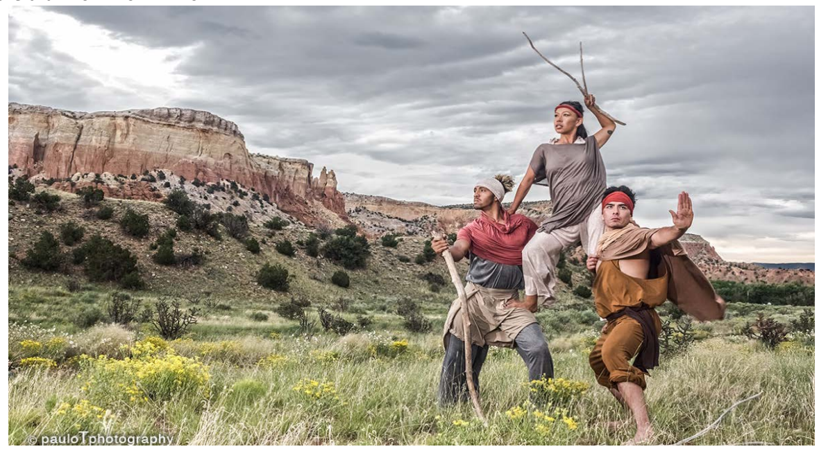
NM Arts Grantee, Dancing Earth Indigenous Contemporary Dance Creations.

In FY20, NMA also funded programs from five organizations run by Native people and/or that support Native art. The funded organizations are diverse. Dancing Earth are the creators and presenters of indigenous contemporary dance programs. Indigenous Solutions presents music, arts and indigenous wisdom to Native communities. Southwestern Association for Indian Arts operates the annual Indian Market. Ralph T. Coe Foundation for the Arts raises awareness of indigenous art. The Wheelwright Museum of the American Indian offers unique exhibitions of contemporary and historic Native American art. Additionally, two NMA-funded programs support Native communities. LOOM Indigenous Arts Gallery, presented by gallupARTS, spotlights contemporary, socially-engaged Native artists through monthly shows. The Santa Fe Independent Film Festival's (SFiFF) Indigenous Film Program highlighted more than 20 films in FY20.