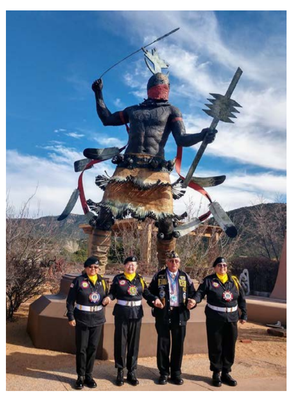
Kewa Pueblo (Santo Domingo) Guard Veterans Day Celebration.