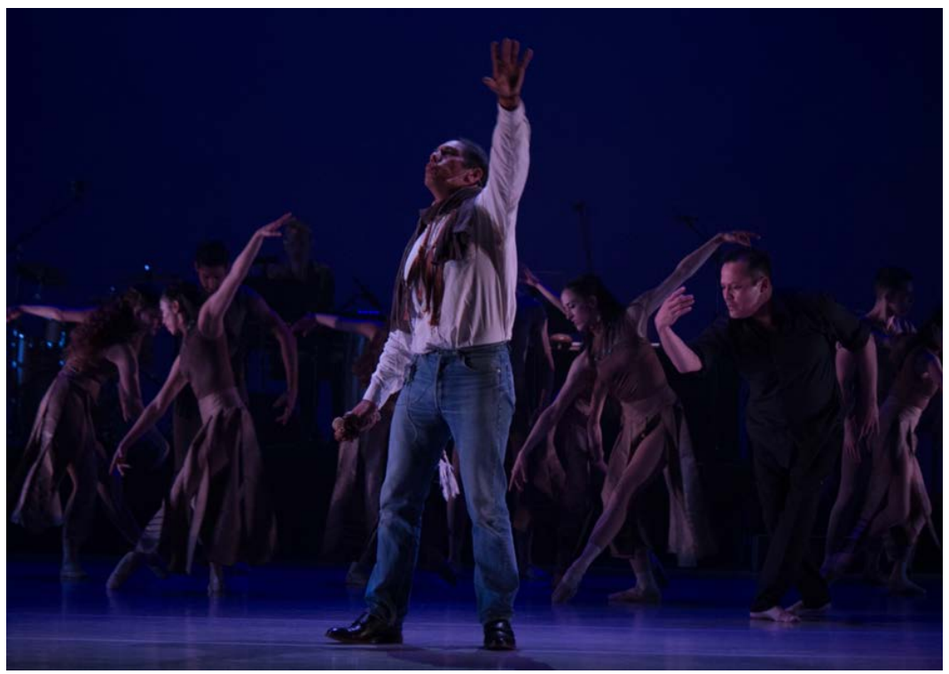
Sacred Journeys II, a reflection of New Mexican cultures through dance, music, and spoken word.