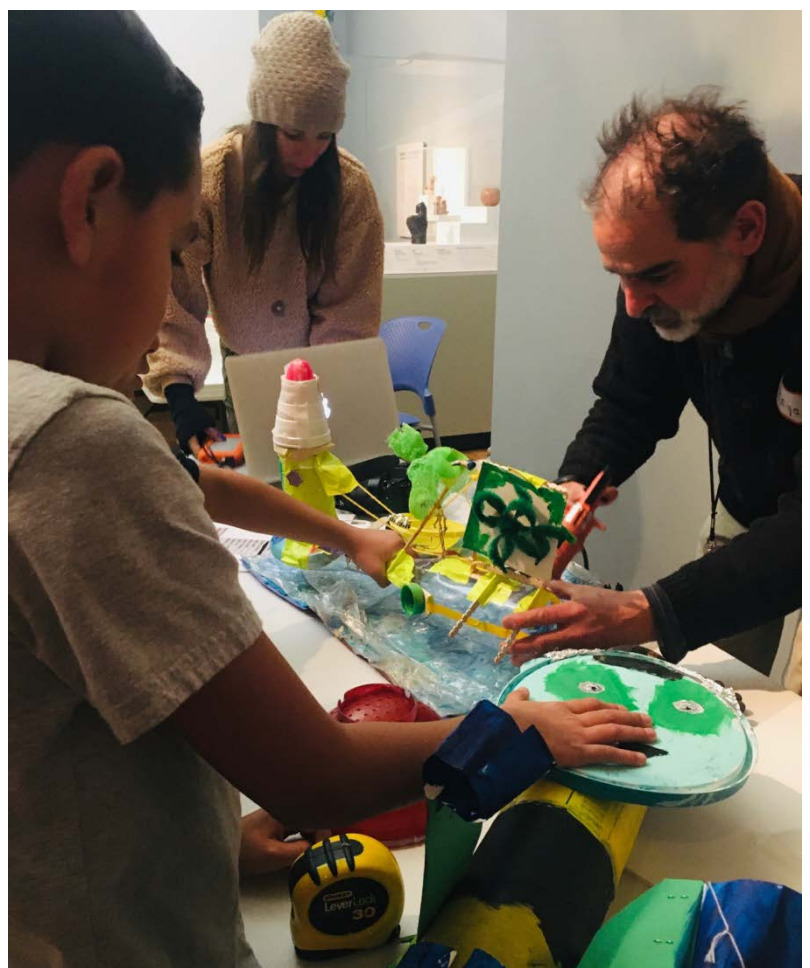
Kha'p'o Community School Museum Installation. Photo courtesy of MOIFA.