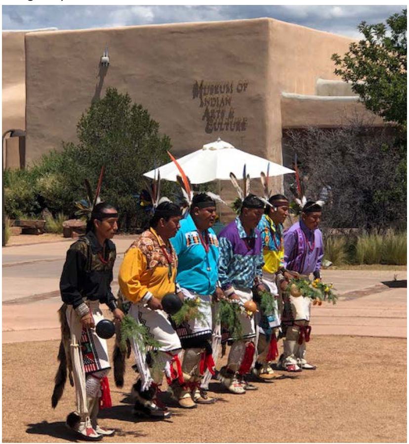
Voices of the Clay: Opening Exhibit celebration. San Ildefonso Dance Group.

The exhibit utilizes new methodologies by combining discussion with descendant community members, museum object research, art production and social context. Even more astounding, the exhibit featured never exhibited MIAC collections. Voices of the Clay is a testament to MIAC's collaboration with tribes and curators. The San Ildefonso Pueblo was intimately involved in the curating, preparation and opening of this amazing exhibit. Approximately 800 guests, including tribal leadership, attended the community grand opening of Voices of the Clay . The songs of the San Ildefonso dancers filled Milner Plaza, as a group of about twenty women from the San Ildefonso Pueblo Women's Club came together to make a feast large enough to feed over 700 people. They prepared the food and served all who came for the day. The community co-curators raised the funds for the feast, and the San Ildefonso singers asked to dance and pray in the gallery to bless the exhibition.