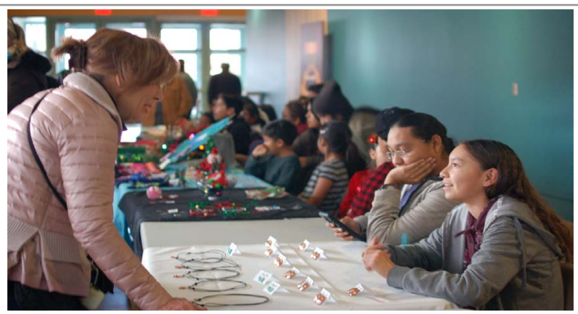
Native Youth Winter Show.