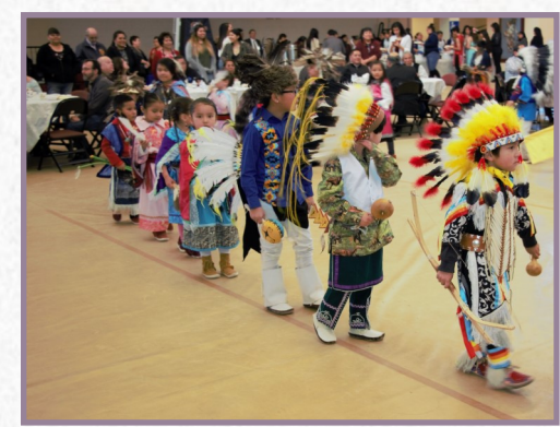
SFIS Community Luncheon